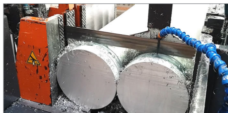
CUT BILLETS / ROD BLANKING