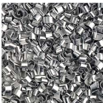
TYPICAL SigmaChip A6 Chips

Short, tightly curled chips and rapid metal removal rates ensure greatly reduced machining times over all-purpose grades such as 6082/H30, together with an excellent, bright surface finish. These attributes are combined with very good anodising and corrosion resistance.